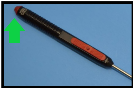
Intact end cap (ok to use)

Re-use of a single-use device is prohibited. Hazards and risks associated with re-using this product are not limited to the above referenced examples and should be considered when using this product.